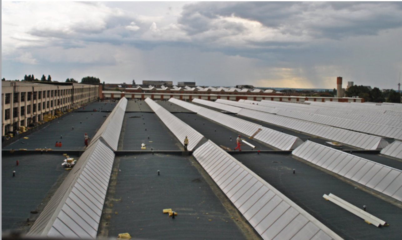
10,000 sqm of clear SUNLITE 16mm X-Lite multiwall polycarbonate skylights installed over a new shopping mall in Craiova, Romania.